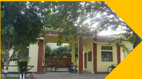
Women's Hostel. (Geeta Devi Mahila Chhatrawas)