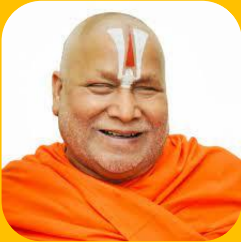
Jagadguru Swami Rambhadracharya Ji Maharaj, Hon'ble Lifelong Chancellor