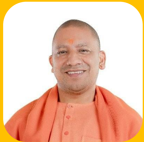
Shri Yogi Adityanath, Hon'ble Chief Minister, Uttar Pradesh