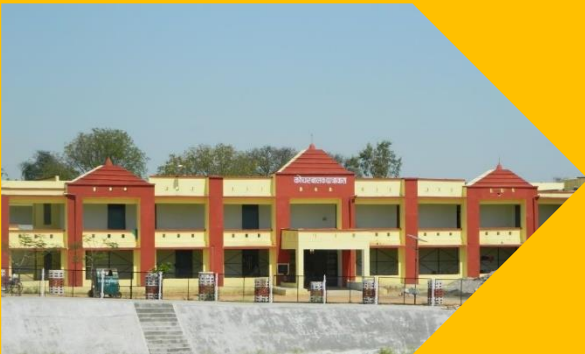
Men's Hostel. (Kochar Chhatrawas)