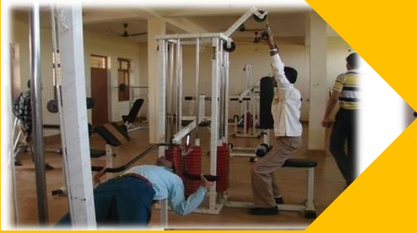
University's Well-Equipped Gymnasium especially for divyang students.