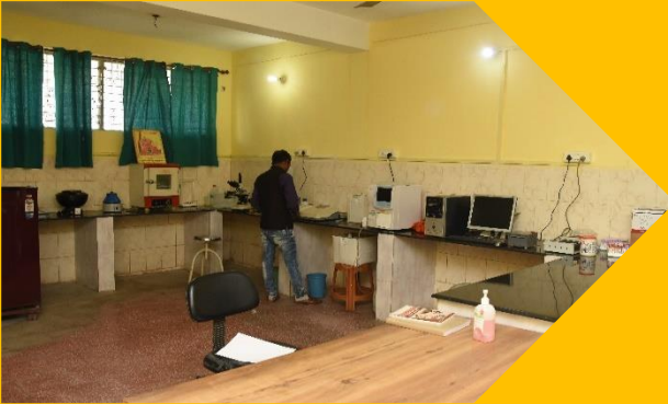
University's pathology lab.