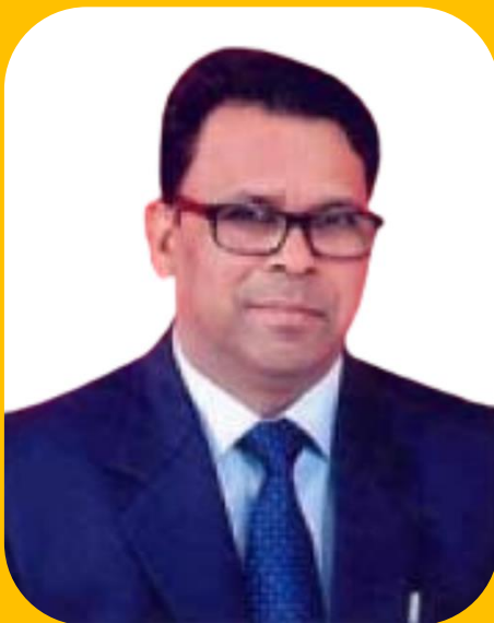
Shri Narendra Kashyap Hon'ble Minister Divyangjan Sashaktikaran Vibhag, Government of Uttar Pradesh